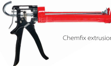
Chemfix extrusion tool.