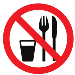
DO NOT EAT

PROJINT FUSION IS NOT A TOXIC PRODUCT. HOWEVER CARE SHOULD BE TAKEN NOT TO INGEST THIS PRODUCT. IF INGESTED SEEK MEDICAL ATTENTION IMMEDIATELY. IF PRODUCT GETS INTO EYES RINSE THOROUGHLY WITH WATER AND SEEK MEDICAL ATTENTION.