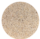
NEUTRAL | BUFF